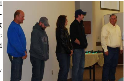
FNL Staff receiving Performance Excellence Awards.