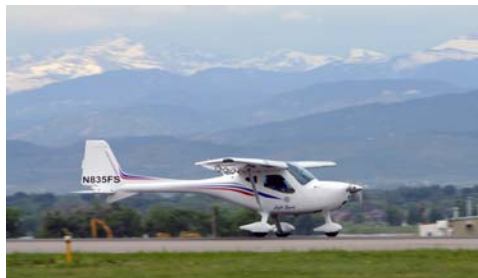
A student with The Flying School taking off in a two-seater Remos Sport Plane.

Jack has always maintained that if the general economy catches