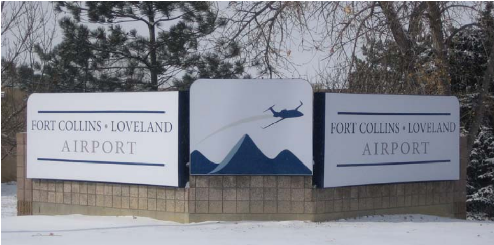
New Airport entrance signs welcome travelers and pilots alike.